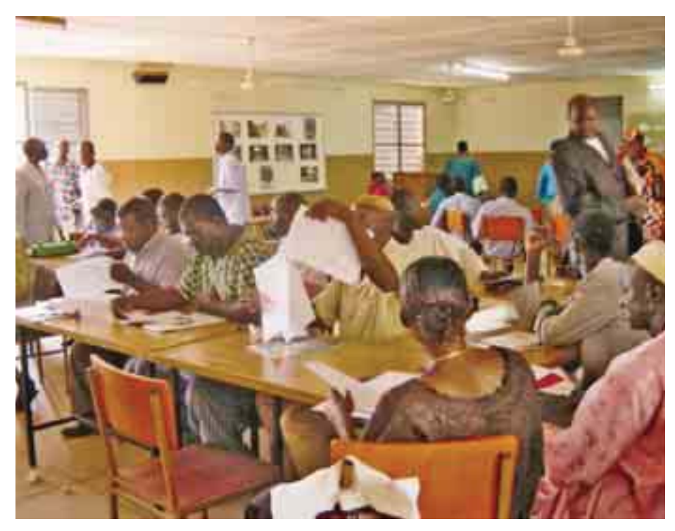
Stakeholders divided into two groups discussing the scenarios during the final workshop on strategic FSM planning in Ouahigouya, Burkina Faso.

these results, we chose the involvement approach consisting of focus group discussions and all-stakeholders workshops. During the final workshop, the entire involvement process was evaluated by the stakeholder themselves through a questionnaire.